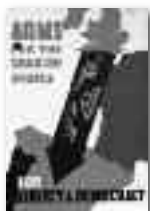
Pamphlets from the TUC collection.

The project will result in over 10,000 pages of archive material being made available online free of charge. Transcriptions will be available for