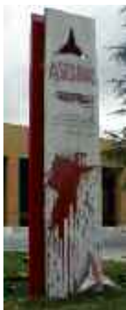
VANDALISED: The memorial was soon cleaned up.

Sadly, it took only a few days following the unveiling for the memorial to be defaced with red paint, though the university acted promptly to remove the graffiti.