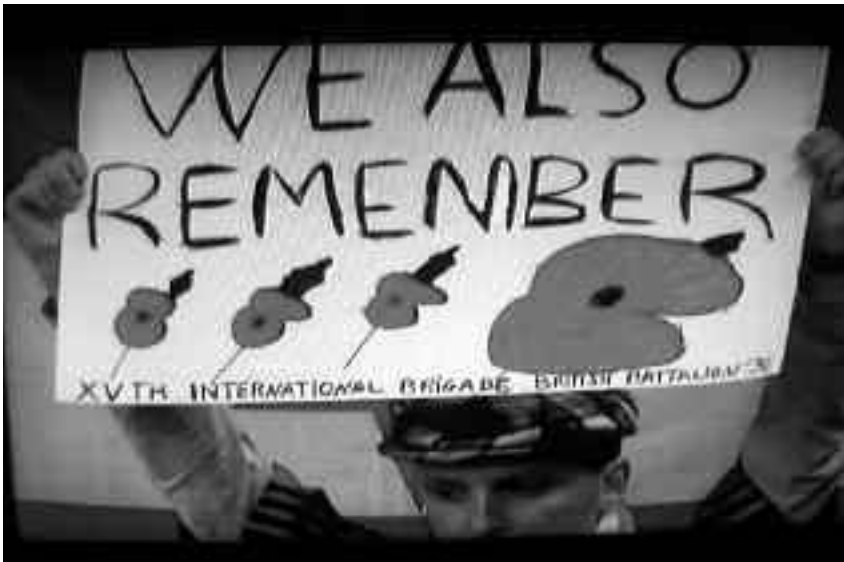
POPPY DAYS: The placard (left) seen by TV viewers last November and (right) a cutting from the Daily Worker showing Brigaders leaving a wreath at the Cenotaph war memorial in London for Remembrance Day 1938. See “Remembering the Brigaders on Remembrance Day?”