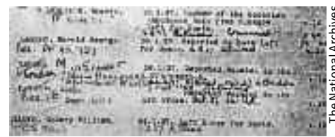
One entry for Lesser, two volunteers.