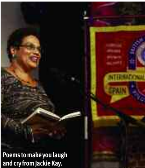
Poems to make you laugh and cry from Jackie Kay.