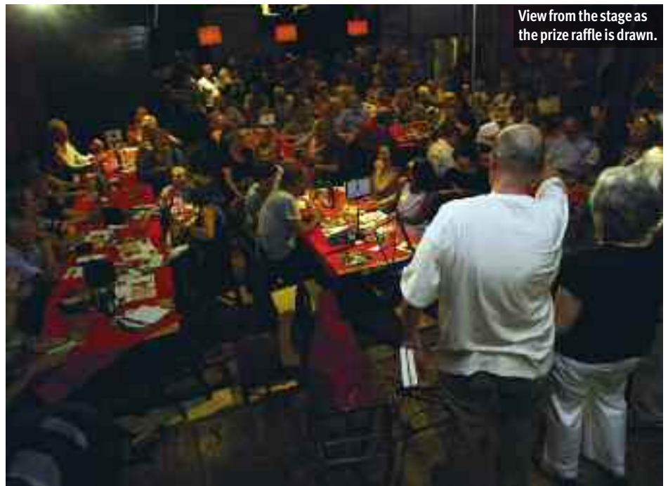
View from the stage as the prize raffle is drawn.