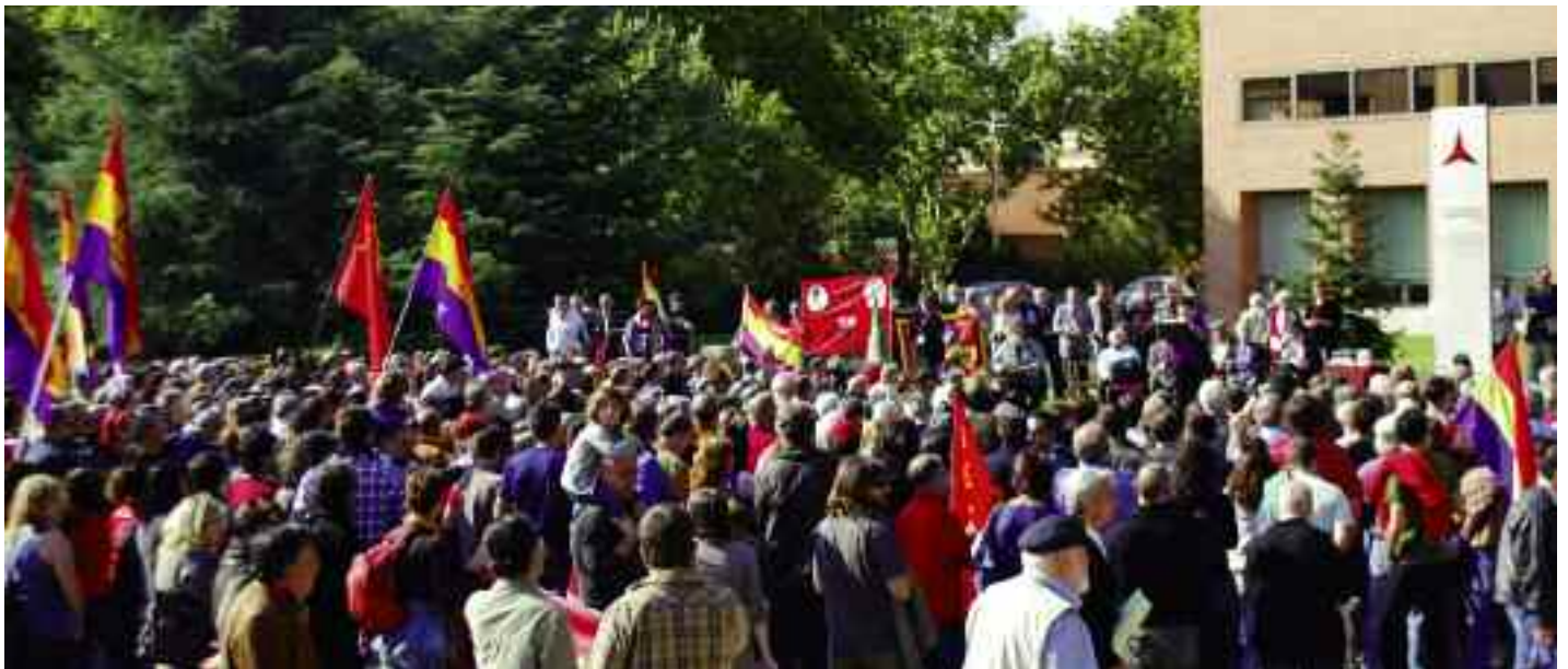
CROWD: Over 1,000 people attended the unveiling of the new memorial to the International Brigades in Madrid (seen on the right).