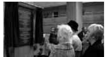
MEMORIAL IN SWANSEA: A plaque was unveiled in Swansea's Civic Centre on 14 December 2011 to the 11 local volunteers who fought in the Spanish Civil War, three of whom were killed in Spain. It was unveiled by the Lord Mayor of Swansea, Ioan Richard.

● The new IBMT constitution , as amended at the 2011 annual general meeting, is available for viewing or download on our website: [www.international-brigades.org.uk] . A printed copy can also be obtained on request by sending a stamped addressed A5 envelope to: IBMT, 6 Stonells Road, London SW11 6HQ.